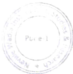
Deputy Registrar (P.G. Admissions)