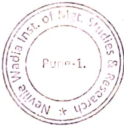
Deputy Registrar (P.G. Admissions)